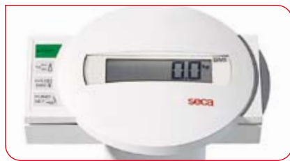
All it takes is the press of a key to find out BMI.

The seca 769 is extremely energy-saving and thus very cost-effective. The minimum power consumption of the low maintenance column scale ensures that a large number of weighings are possible with just one set of batteries. The automatic switch-off function is another reason for the low energy consumption.