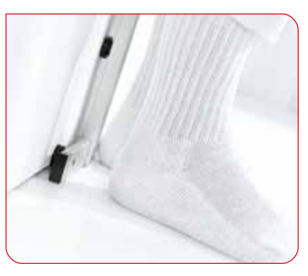
The foot positioner ensures exact positioning and precise measurements.

The telescoping function ensures that readings are always at eye level, for accurate readings regardless of the angle from which one looks. The seca 222 comes with a round 4" attachable headpiece, as required by the CHDP program and pediatric subspecialty practice. When not in use, the measuring slide can be folded down for safety.