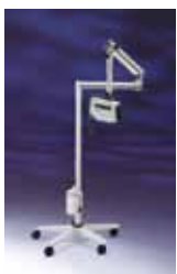
89000A Video Colposcope with Swing Arm

65184 UPC 21S Print Pack—3 sets of 80 prints with ink cartridges (for UP20 printer model)