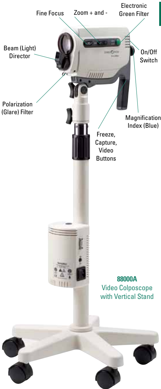
88000A Video Colposcope with Vertical Stand