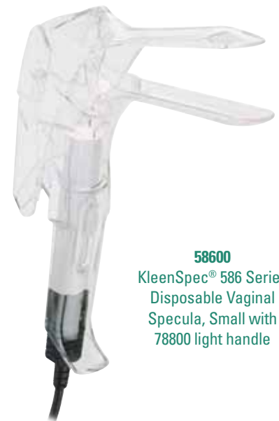
58600 KleenSpec® 586 Series Disposable Vaginal Specula, Small with 78800 light handle

58601 KleenSpec 586 Series Disposable Vaginal Specula, Medium (25/box; 4 boxes/case)