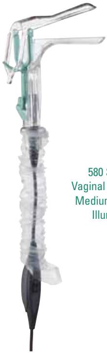
58001S 580 Series Disposable Vaginal Specula with Sheath, Medium (shown with 78810, Illumination System)