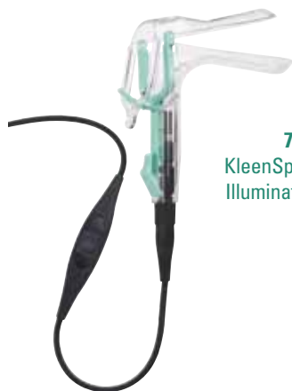
78810 KleenSpec® Corded Illumination System