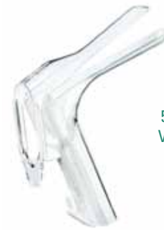
59000 590 Series Disposable Vaginal Specula, Small

58014 KleenSpec Vaginal Specula Storage Dispenser