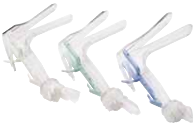
58000S, 58001S and 58004S 580 Series Disposable Vaginal Specula with Sheath

58004S KleenSpec 580 Series Disposable Vaginal Specula with Sheath, Large (15/box; 4 boxes/case)