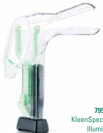
79910 KleenSpec® Cordless Illuminator