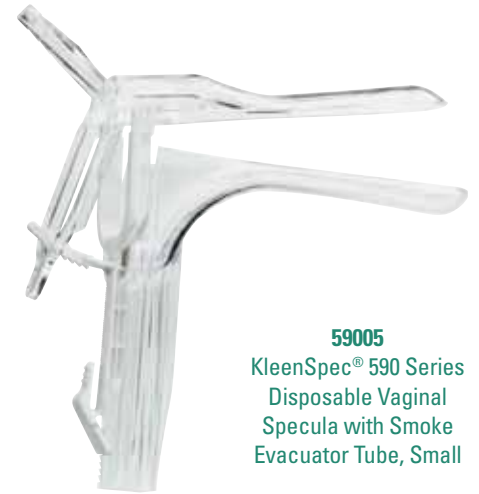
59005 KleenSpec® 590 Series Disposable Vaginal Specula with Smoke Evacuator Tube, Small

59006 KleenSpec 590 Series Disposable Vaginal Specula with Smoke Evacuator Tube, Medium (11/box; 4 boxes/case)