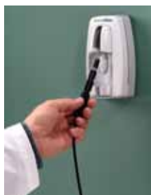
78820 KleenSpec® Corded Illumination Storage System