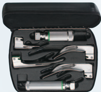
#65122 MacIntosh #3 and 4, Miller #0 and 2, with Stubby Battery Handles and Case