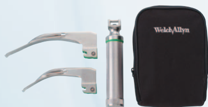
#65103 MacIntosh #3 and 4 and Medium Handle