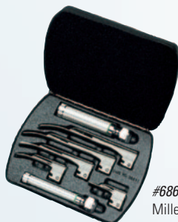
#68696 Miller #0, 1, 2, 3, 4

Each set includes both of our “AA” and “C” cell battery lightweight handles and lightweight blades for maximum maneuverability.