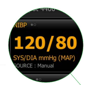
Easy to Navigate, Easy to Use

Save time and help reduce data entry errors by sending patient data to the EMR.