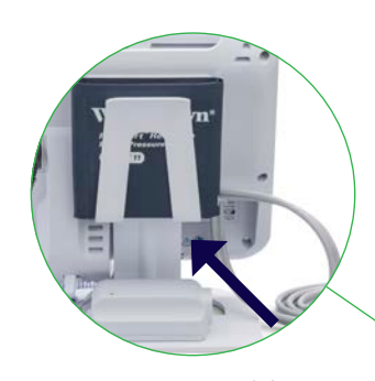
EMR Connectivity via USB Cable