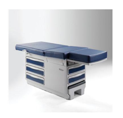
Flat Provides an excellent working surface for exams and procedures where you need a little more space.