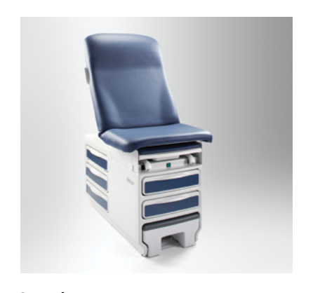
Seamless Plush, seamless upholstery designed to be more comfortable for the patient and easier to clean for you.