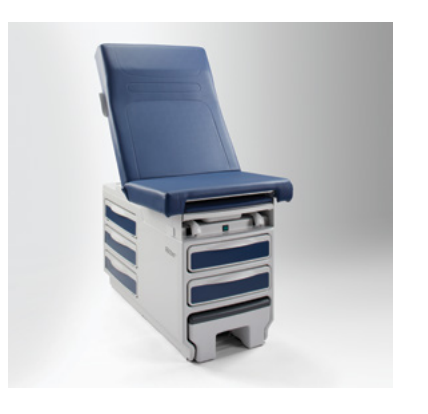
Soft Touch Designed to be comfortable for the patient yet durable enough to stand up to the rigors of the clinical environment.