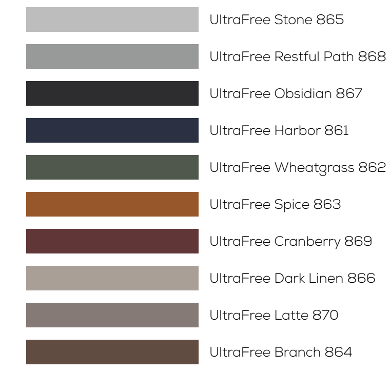
*ULTRALEATHER® BY ULTRAFABRICS®