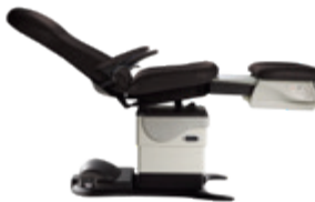
Seated Exam Position