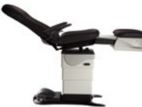
Standing Exam Position