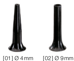
[01] Ø 4mm [02] Ø 9mm