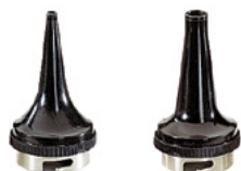
[01] Ø 2.2mm [02] Ø 5.5mm