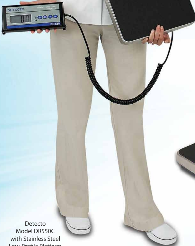
Detecto Model DR550C with Stainless Steel Low-Profile Platform

DETECTO is the largest medical scale manufacturer in the United States providing clinical-grade accuracy and dependability for over a century.