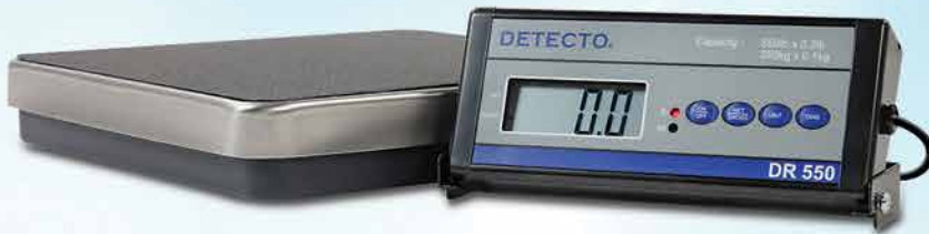
FLOOR / TABLETOP

The indicator's versatile mounting bracket and coiled cable allows the display to be positioned on the floor or tabletop for quick mobile weighing use or you may permanently mount it on the wall using the included screws (see below).