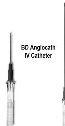
BD Angiocath IV Catheter