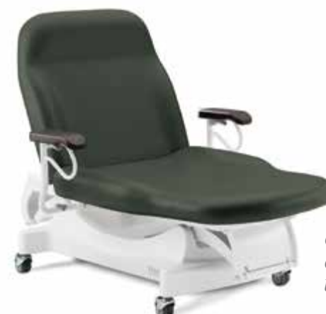
Optional casters can support 650 pounds (but should not be used to move patients).