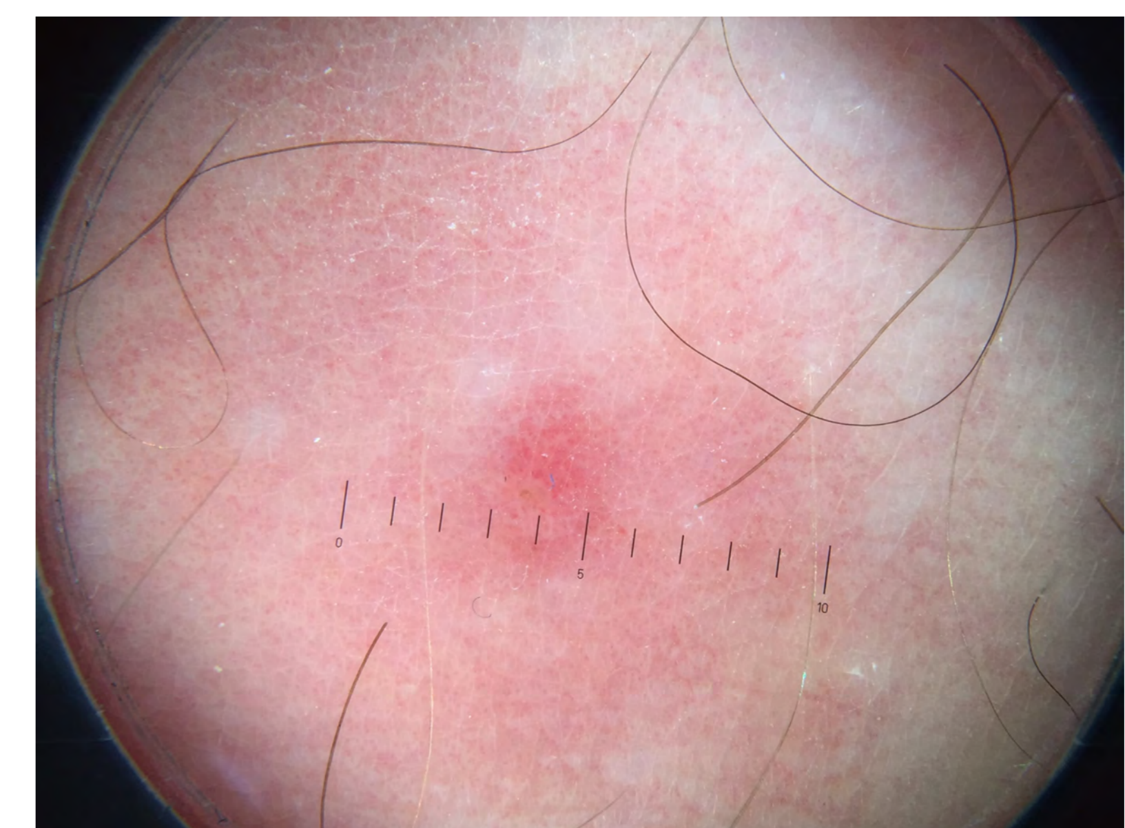
Tick bite spot

After removing the tick, the bite spot has to be monitored for a few weeks. It is possible to send your tick to a laboratory for testing to see if they carry borrelia. This approach however is a controversial issue. When blood samples are taken for a determination of antibodies it should be understood, that it takes a certain time to verify them.