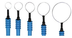
Disposable Dermal Loops †