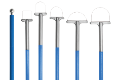
Disposable LLETZ/LEEP Loop and Ball Electrodes †