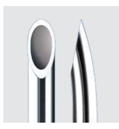
BD Modified Tuohy Point