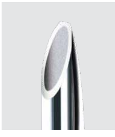
BD Tactile Tuohy Point

Available in BD Regional Anesthesia Trays